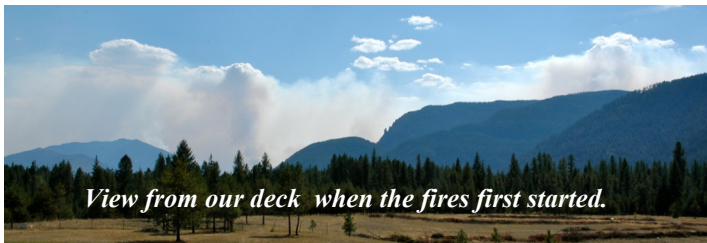
View from our deck when the fires first started.

Greetings from Northwest Montana. We are thankful for all the Lord has shown us throughout this year, and many of you are a part of that with your prayers and support for us and this ministry. The summer was different in the sense that our camps were all family reunions, along with a couple retreats. When we first started this ministry we had thought that most of our camps would involve mainly families, but God took us on a different path for which we have been very grateful for the friendships and help that He has sent to us through the years. Church work groups became the normal and one that we loved. We praise Him for the many lives that we have seen changed for the Lord. It is always fun for us to have family reunions though and to see families that have been here before and new ones that were here for the first time. It is always encouraging to see families who make it a priority to bring their family together, often from around the country. This is not an easy logistical undertaking, but one that is worthwhile. One thing we have noticed with families who have returned is that there are some individuals who were not here, as they had a new home in heaven, and other families had new little ones to bring smiles to the faces. We all have one life to live, and what is done for Christ is what will last.